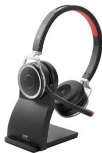
VT 9605 BT Duo