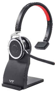
VT 9605 BT Mono