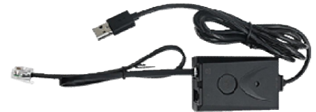
VT RJ ENC 01

(one for Snom, Aastra, Mitel, ShoreTel, Polycom, Sangoma, Fanvil, Grandstream, Yealink, Digital, NEC, Toshiba, Nortel, etc., Another one is compatible with Cisco Phones.)